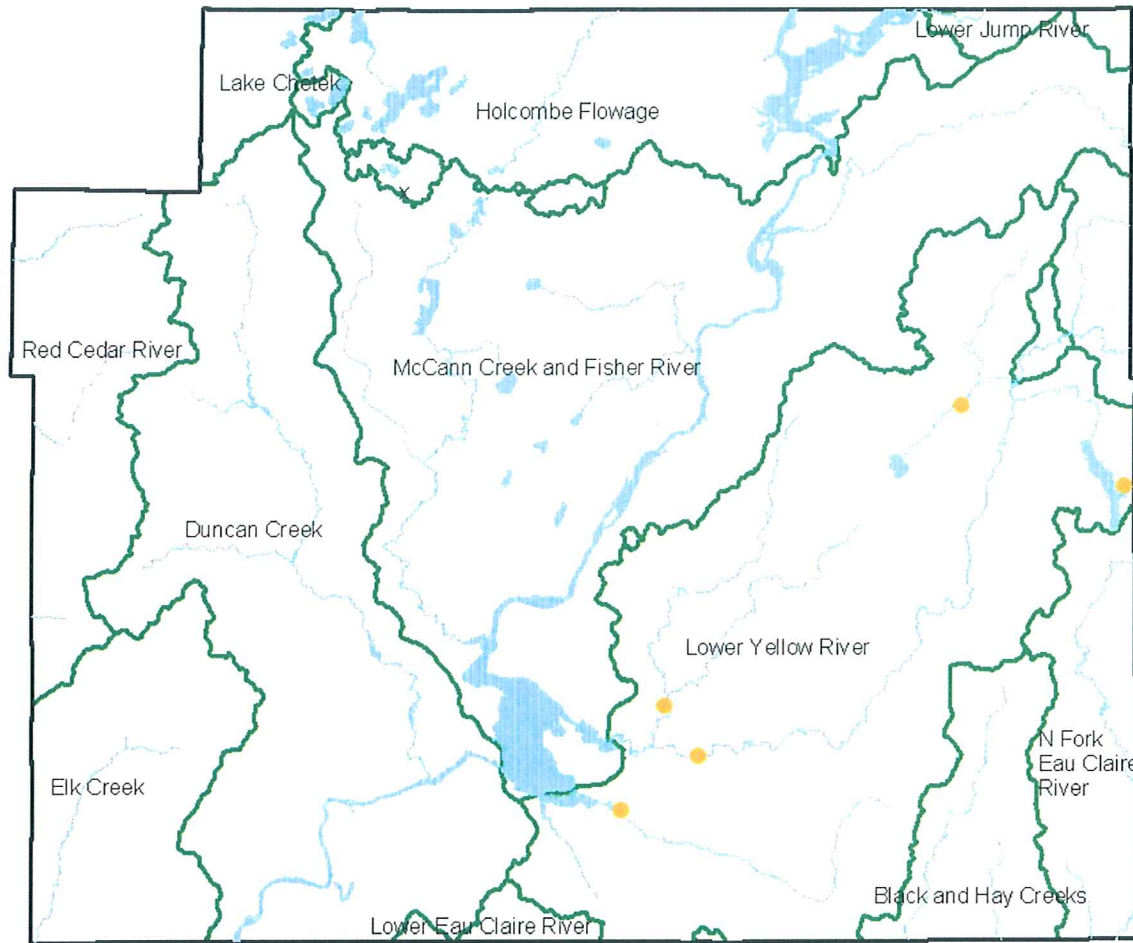
Map 4 - Location of Major Surface Waters, Watershed & Water Resource Monitoring Sites